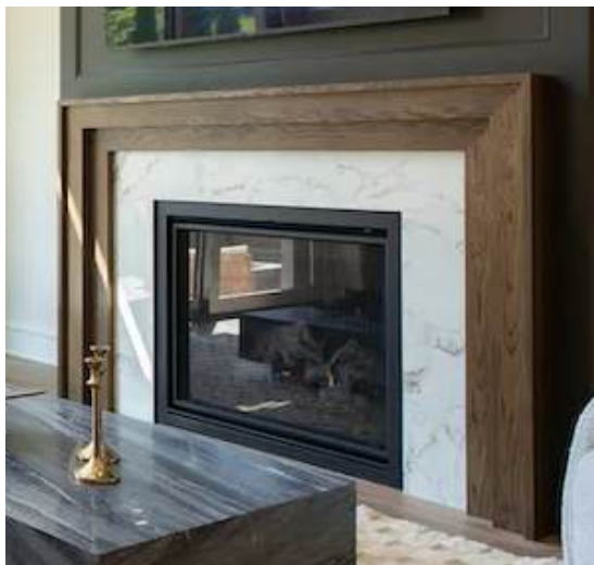
Living Room Fireplace Example

*actual fireplace surround will vary in material and colour.