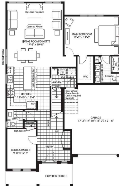
FIRST FLOOR ELEVATION A