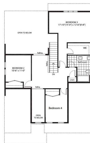
LOFT ELEVATION A