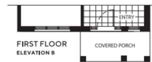
FIRST FLOOR ELEVATION B