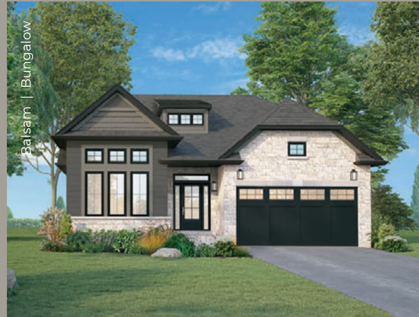
Balsam | Bungalow