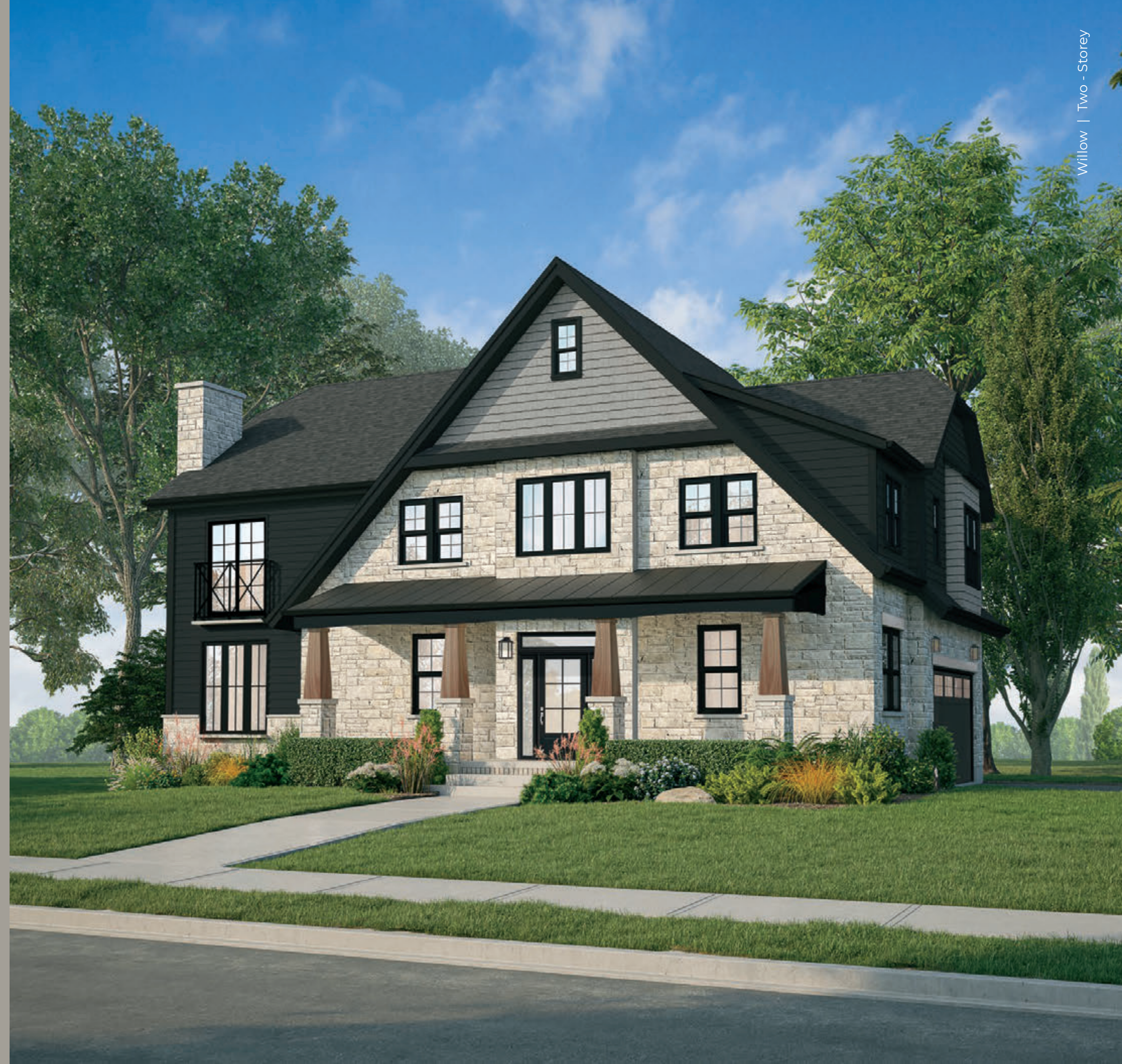
Willow | Two-Storey