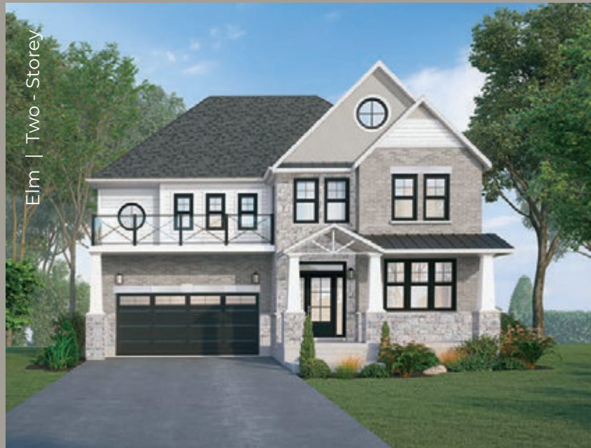
Elm | Two-Storey