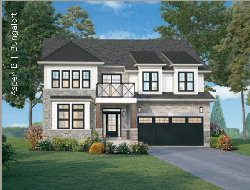
Aspen B | Bungalow