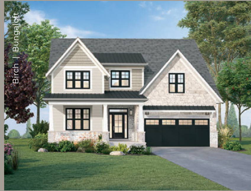
Birch | Bungalow