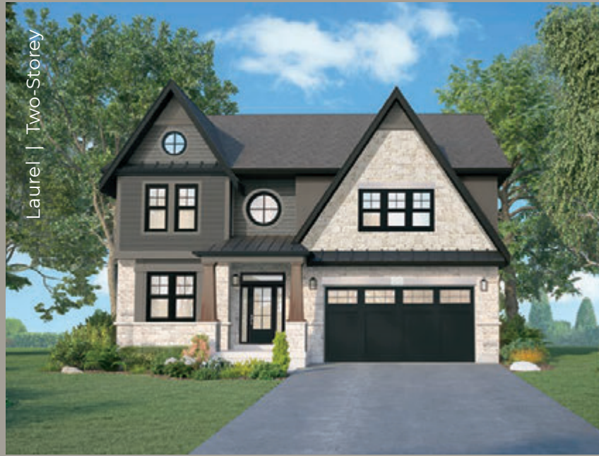
Laurel | Two-Storey