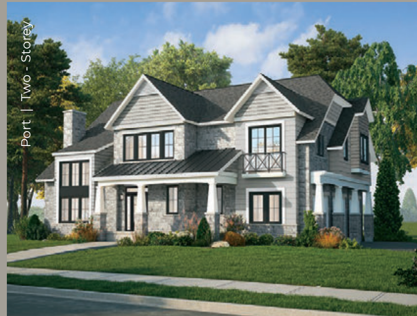
Port | Two-Storey